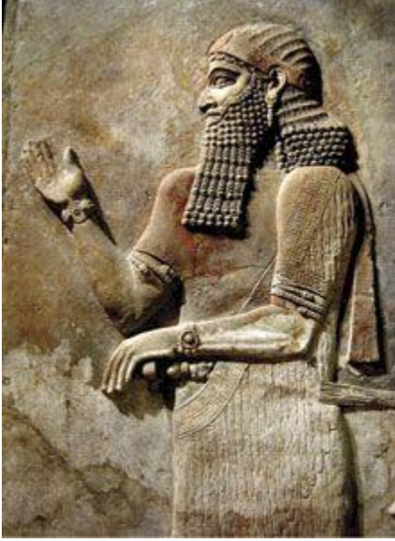
King Sennacharib, 705-681 BC

What does God want us to do when trouble comes calling?