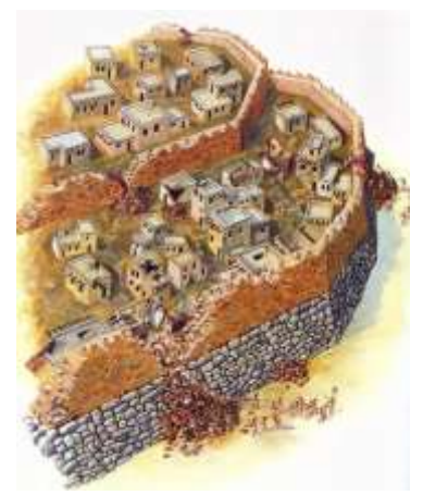
B. God expects us to obey His Word.

Your Jericho will fall if you will simply obey.